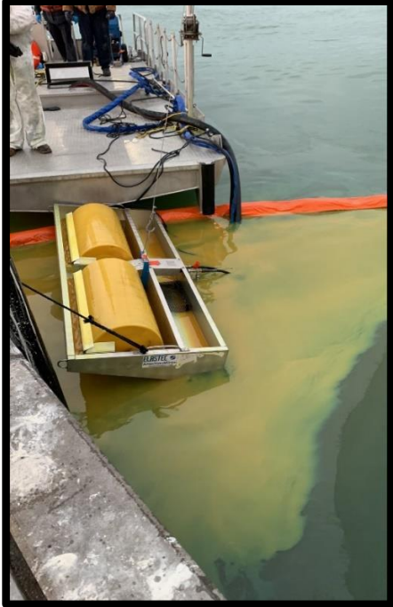
Photograph 2: Drum skimmer removing product from the surface of the water near Dock 5.