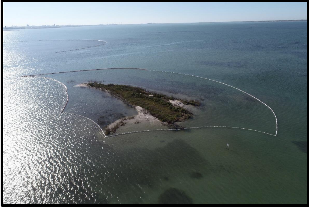
Photograph 6: Protective boom surrounding habitat area.