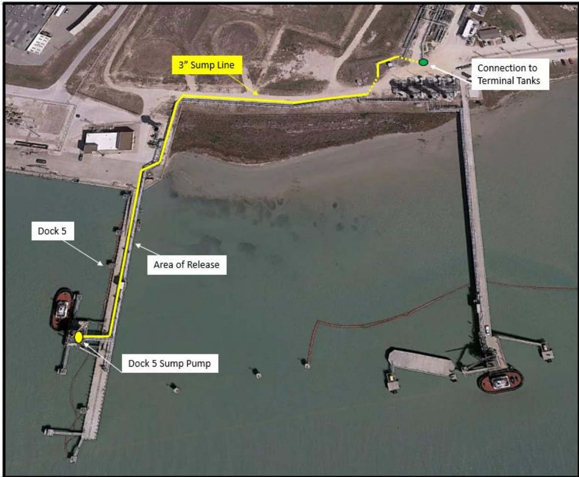
Photograph 1: Flint Hills Resources Ingleside terminal sump line location.