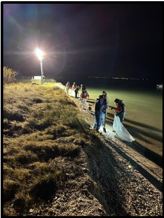
Photograph 3: Emergency response crew responding during night hours, with the use of a portable light plant, performing shoreline reconnaissance and cleanup.