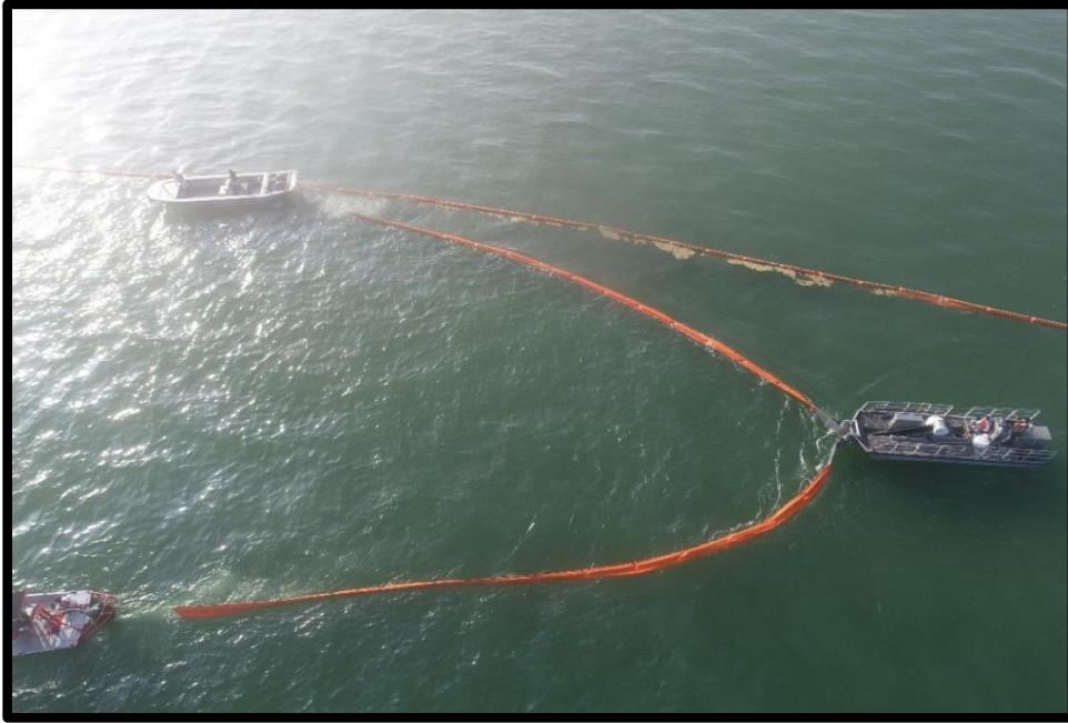
Photograph 4: V-boom strategy collecting product along protective boom.